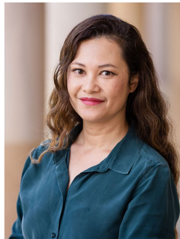
Family name beginning with M-Z; Lorraine