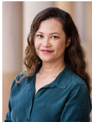
Family name beginning with M-Z; Lorraine